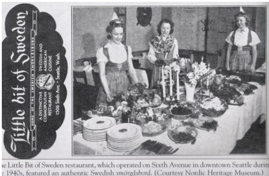
The Little Bit of Sweden restaurant, which operated on Sixth Avenue in downtown Seattle during the 1940s, featured an authentic Swedish smörgåsbord.

Engstroms Home Bakery Skandia Bakery & Café The Chalet (restaurant) – Eagleson Hall near UW campus Little bit of Sweden (restaurant) – 6 th Avenue in Downtown Ivan Anderson and Co. (construction) – West Seattle